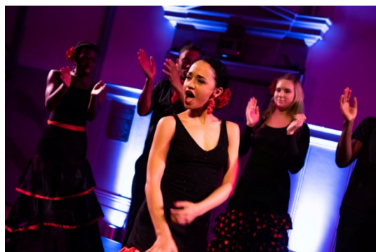
The young people at Wac Arts perform Flamenco

Wac Arts thanks all of those who supported the event and made raising such a fantastic amount possible; auction and raffle donors, Cabaret committee, catering crew, creative team, Franca Manca, parents and carers in supporting the young people, Patrons, performers, Property Divas, Wac Arts staff, technical team, Thornton's Budgens, tutors and volunteers. We would also like to thank the generous guests who came to support Wac Arts and have enabled us to far surpass our targets.