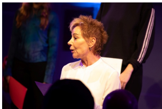
Zoe Wanamaker performing at the Wac Arts Cabaret