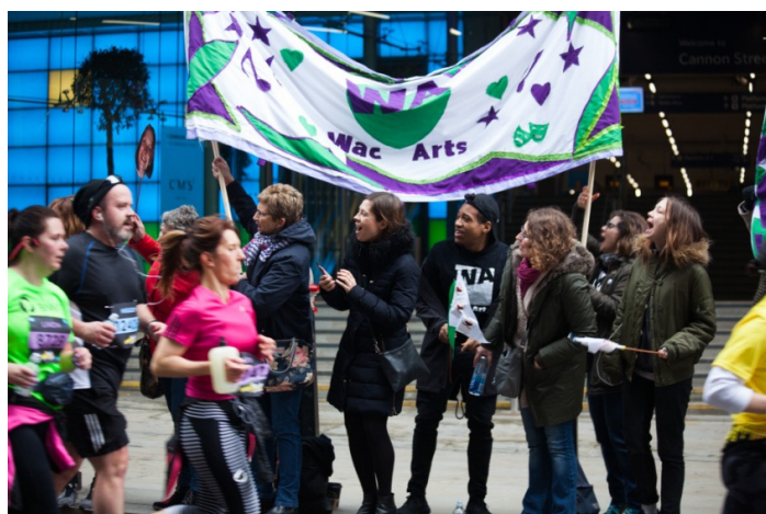
Students and employees of Wac Arts participating in London Landmark Half Marathon 2018.

As well as a running team, our students will also be entertaining the crowd with an exciting 30 minute performance of vibrant and uplifting songs. It's going to be a brilliant day for everyone getting involved – all running for two great causes.