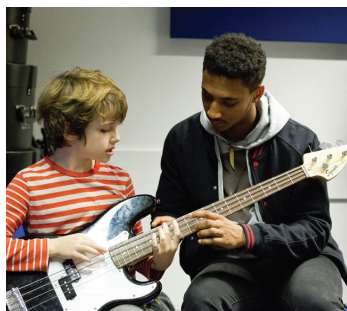
Junior Wac Arts