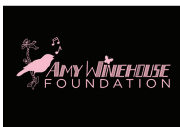
Amy Winehouse Foundation