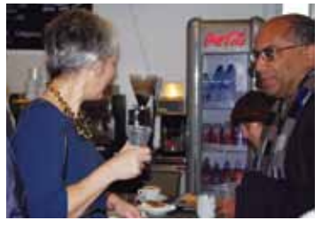
Trustees Celebrating at the Relaunch