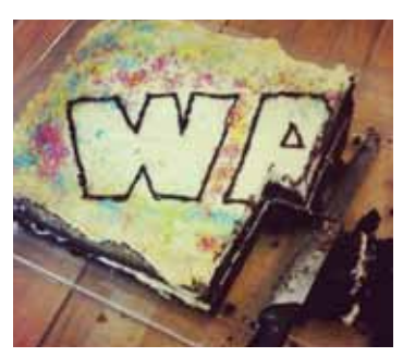
Wac Arts Cake