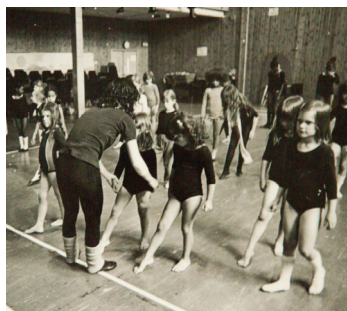
35 years of Wac Arts!