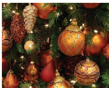
Christmas at Wac Arts!

empowering young people to change their world