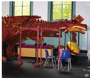
Rehearsals in the Main Hall